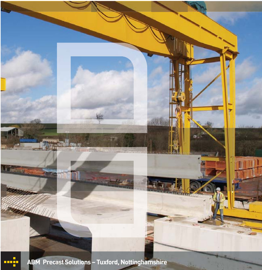
ABM Precast Solutions – Tuxford, Nottinghamshire