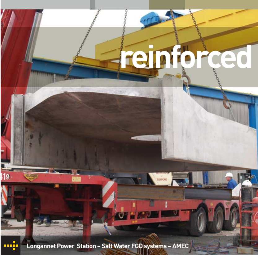
Longannet Power Station – Salt Water FGD systems – AMEC

Where flexibility, durability, ease of construction and value engineering are the driving forces, ABM has the Precast Solution.