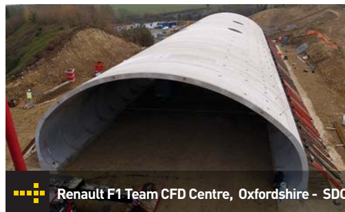
Renault F1 Team CFD Centre, Oxfordshire - SDC