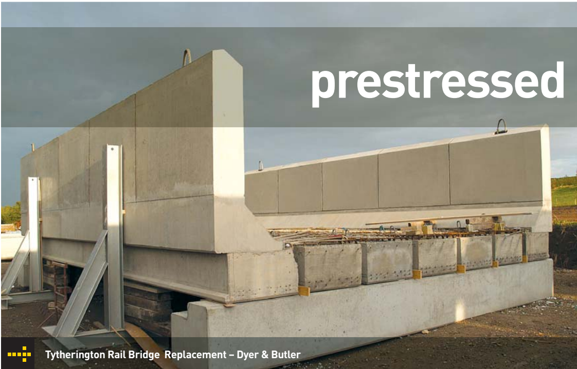
Tytherington Rail Bridge Replacement – Dyer & Butler

Secondary casting of reinforced concrete stringcourses or parapets can significantly reduce time and cost on site, which is all part of the best ABM Precast Solution.